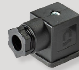
EN175301-803:2006 Type (The order model DIN 43650 A) Connector